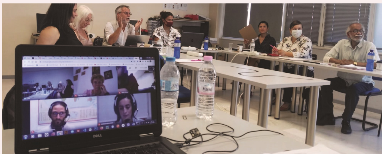
2nd SC meeting

Actually, this was a blended type of meeting that came to fulfill new challenges arised from Covid-19 pandemic situation.