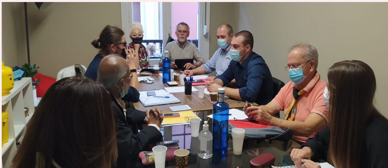
3rd face-to-face SC meeting

Actually, this was a blended type of meeting that came to fulfill new challenges arisen from Covid-19 pandemic situation.